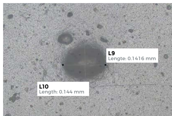
Gel in PE recycle with 10 w% Yparex® 0H17 added