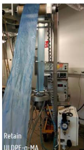
Patchy, Uneven Structure

An example of reprocessing a PE-PA waste stream into blownfilm is shown in the pictures below. When using Yparex® 10403 or 0H247, the balloon becomes uniform and stable, which is critical for a blown film process.