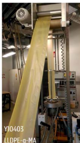
Uniform structure, stable bubble, continuous process